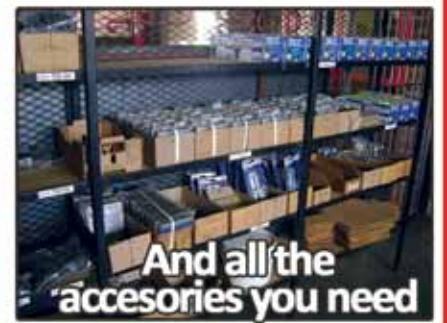
And all the accessories you need