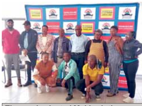
The newly elected Makhuduthamaga Sports Confederation has promised to take sporting activities in the local municipality to new heights.