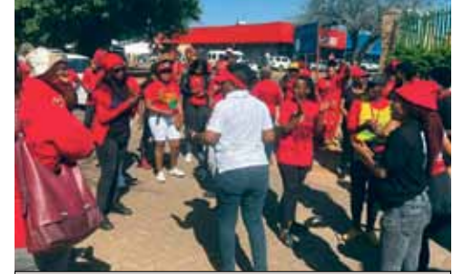
Scores of EFF women chanting outside Groblersdal Police Station to raise concerns on GBV incidents in Sekhukhune District Municipality.

GBV cases and end up losing their lives in the hands of the perpetrators.