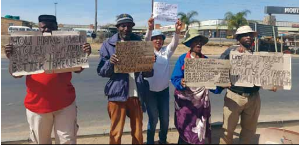
Some of the demonstrators picketing outside Moutse Mall in Dennilton with an aim to raise their concerns and pressure government to incorporate the area back to Mpumalanga Province.