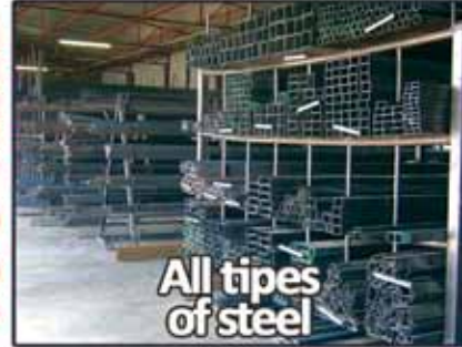
All types of steel