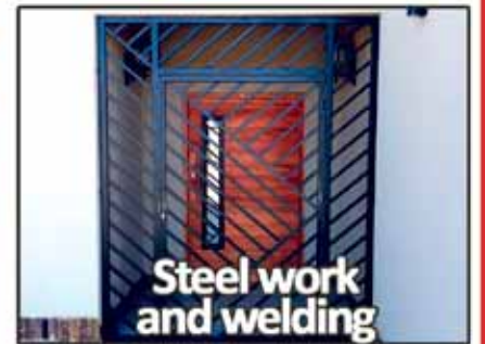
Steel work and welding